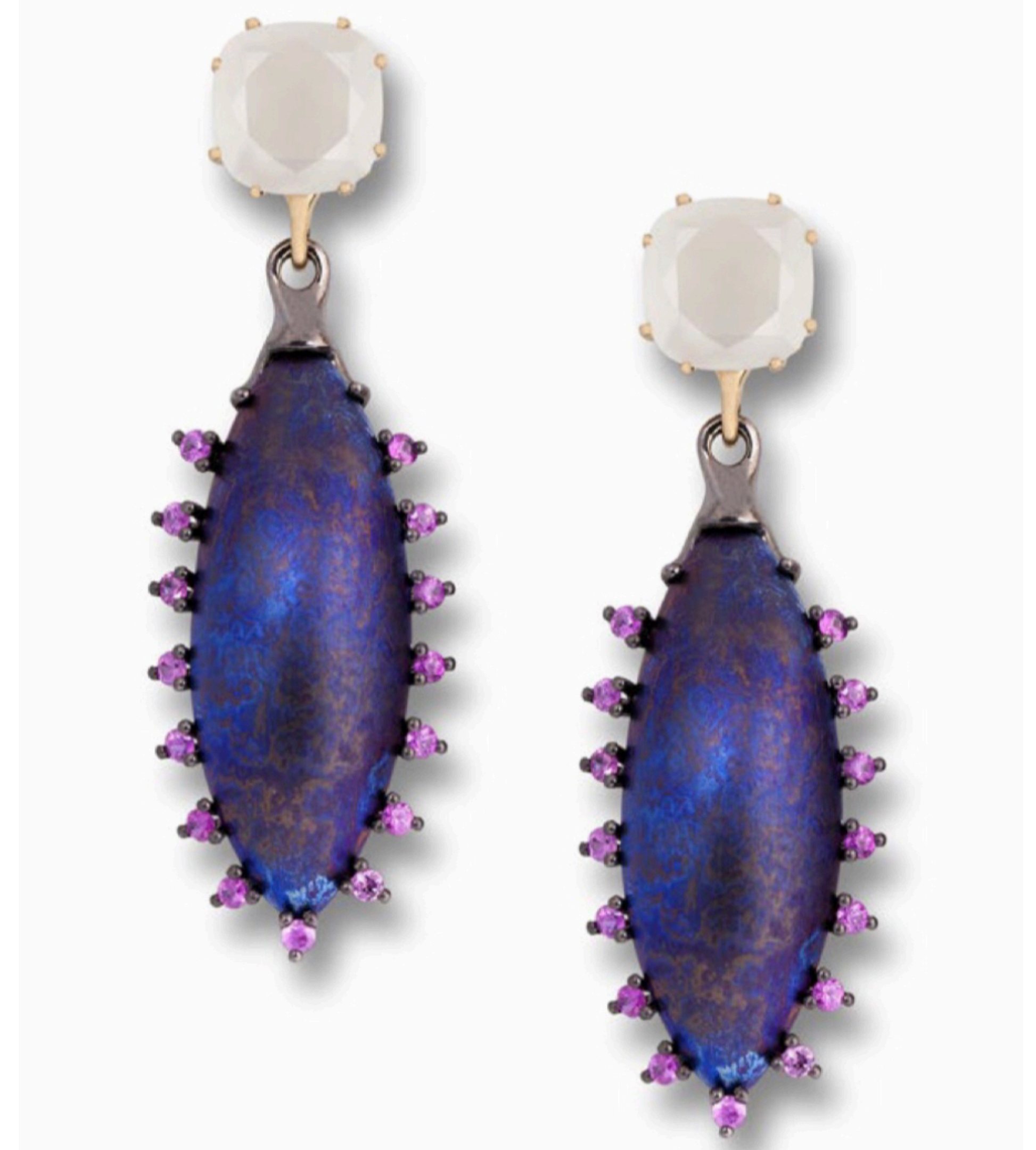
LAVA AND ICE Earrings

Permanent Exhibitions: NATIONAL MUSEUM ZURICH "Alice and Louis Koch Collection".